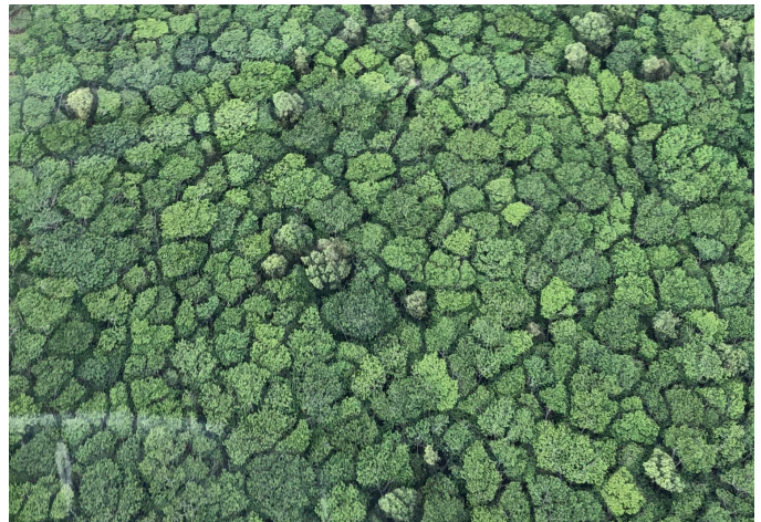
Dense canopy seen from above

In this project, we will exploit the similarity between the two patterns to create realistic trees. To this end, we need to generate tree graphs that fill the noise cells while following the branching rules of the typical trees found in dense forests. These tree graphs will be used by a renderer to create impressive virtual scenes.